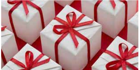
>> CHRISTMAS CATALOGUE