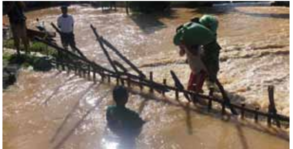
The floods in Cambodia are the worst in years

Even as the impact of Covid-19 continues to devastate the vulnerable economies of Southeast Asia, in recent weeks tropical storm Noul has moved over Cambodia dumping massive amounts of rain, severely affecting several regions. Many of the coastal towns and larger cities, including Phnom Pehn, have not been spared the deluge while many of the smaller towns are reported to be cut off. This has created a great deal of problems for those whose livelihood depends on daily travel and trade at the many markets, which are now under water or swept away.