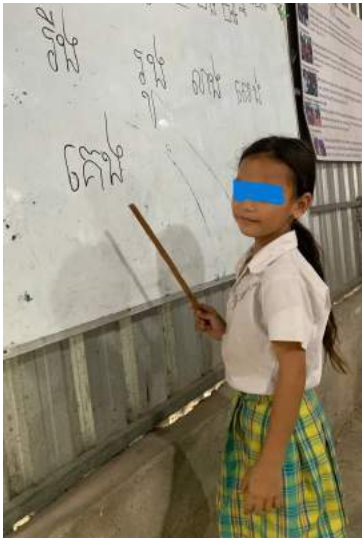
I would like to be a teacher

With the strong support from Cambodia Action, Bethel Mission is able to help the people living in the graveyard, the slum, the urban and the poor rural communities. Lives have been transformed by addressing their physical, emotional and spiritual needs.