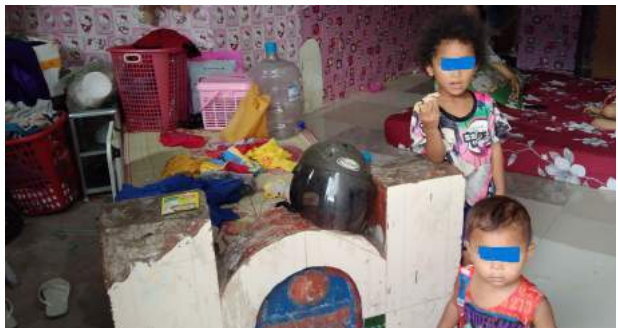
My house among the dead

Now, I can read and write. I help my parents by taking care of my younger siblings and doing some housework after school. I love Sunday School and always bring my siblings to join. I love worshiping and Bible study, learning more through watching the Jesus film and hearing stories from SuperBook.. now I am able to sing songs of worship.