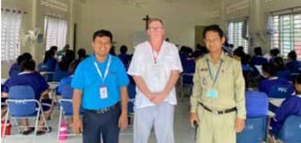
With PFC Director and a prison warden.

I was blessed to have the opportunity to visit the country's largest women's prison in Phnom Penh city and witnessed wonderful praise and worship from those who are imprisoned. This particularly warmed my heart as I stood in a church building that had been built for the express purpose of ministering to those in need. Interest-