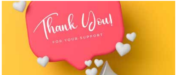
>> YOUR GIFTS MAKE A DIFFERENCE