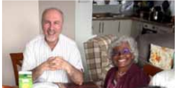
>> STAYING CONNECTED, BY ZORAN SULC