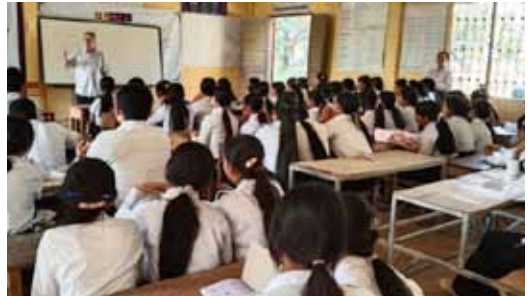
With senior students - Takeo High School

On this trip I was treated to a variety of school sharing opportunities, both in the north of the country and the south. The high school in Takeo province, a place I had been to before, gave me the opportunity to share my journey of grace. This time the head-master of the high school was keen that I speak mostly to the senior classes and so the whole morning consisted of class after class being brought into a large venue, all buzzing with excited young people. I used my allocated time wisely to speak on certain dangers and pitfalls young people fall into, referring to my own life story as an example of God's rescue plan in my life as a young man.