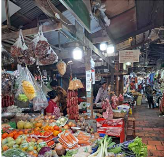
Markets are full

On my previous trips, just after Covid restrictions were lifted, I noted how many businesses had closed and how few visitors could be seen around popular markets. This trip was different. I loved viewing the Russian Market, walking through its narrow alleys. On this trip I was able to buy a number of handmade picture cards and a few other gift items. Well done, Cambodia, for making the country open to visitors.