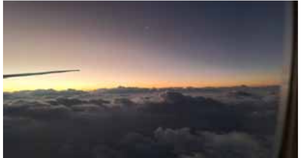
>> CAMBODIA TRIP REPORT