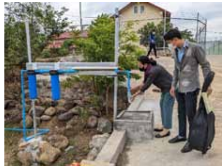
Clean water for the prison

Over the years, the prison has brought different requests to us, all issues that affect the health and well-being of the prisoners. When they asked about the water, we tested and found coliforms, E coli, and excessive hardness, which could cause acute infections and long-term kidney damage. Through help, Sunrise was able to assist the prison by installing a water treatment system. Prisoners helped with the placement of a new tank with a bio-sand filter to clean impurities such as coliforms and E coli from the water supply; other components dealt with water hardness. Praise God for clean water!